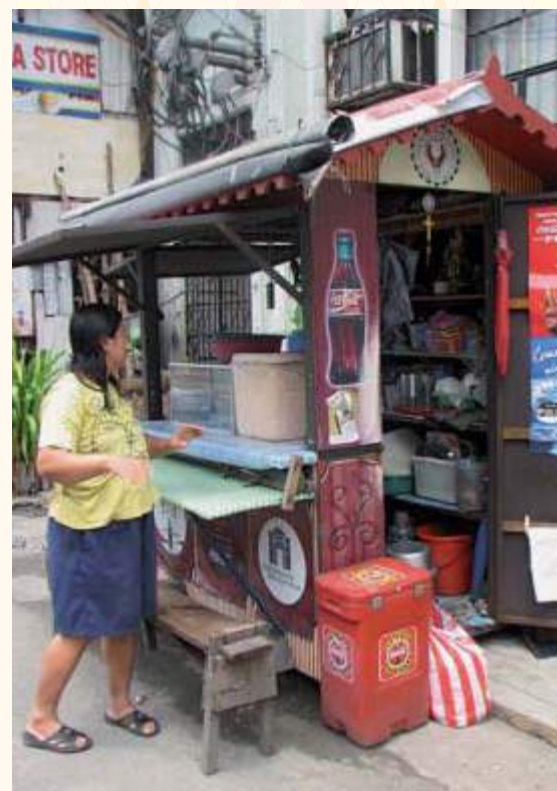
Street food vendor in the Philippines using an improved stove for her business.