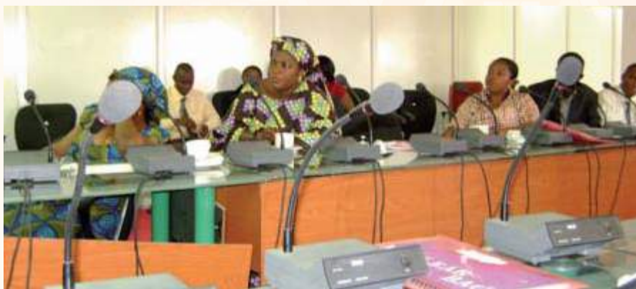
Validation workshop of the Nigeria gender audit of energy policy.

In Pakistan, ENERGIA's gender mainstreaming work with the national biogas programme included a gendered baseline survey of the project. Gender issues were incorporated into the