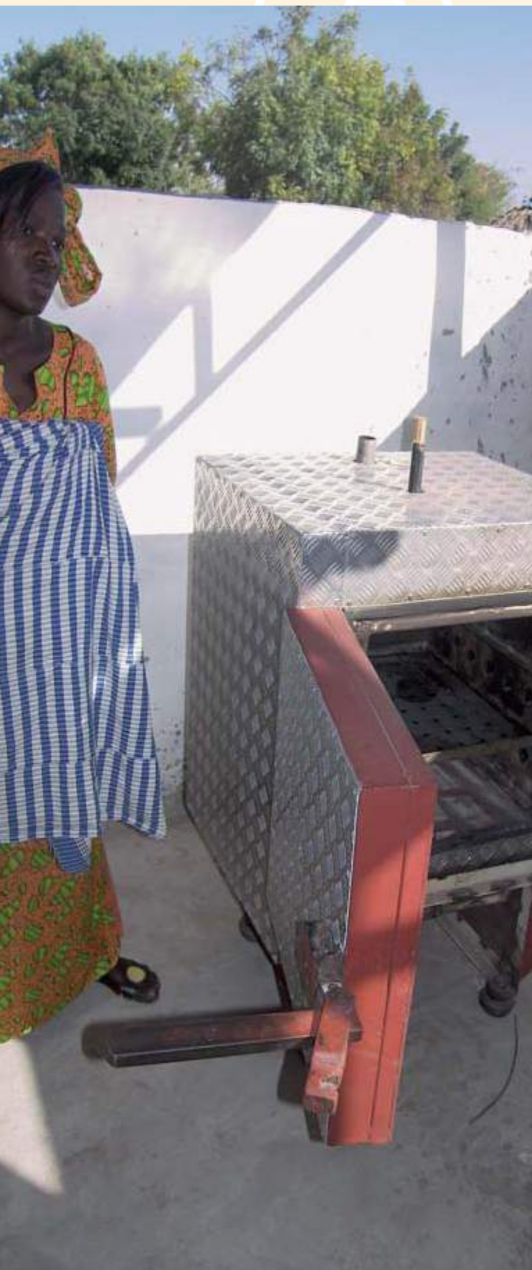
Improved baking oven in Senegal. This oven is a good example of a low-emission energy technology.

There are also discussions about whether a special climate fund is needed to support women's access to cleaner energy systems and equipment. A new proposal by the UNDP Gender Team in the Bureau for Policy Development would establish a Women's Green Business Initiative to channel funding and resources, and provide capacity building and training, for women's enterprises related to climate change mitigation, adaptation and resilience.